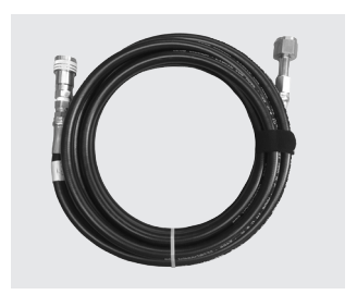
Co2 Hose High pressure Co2 hose, rated for 3000PSI. Equipped with a quick connect and CGA-320.