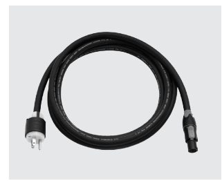
TRUE1 Power Cord Edison to PowerCON True1 cord, suitable for up to 300VAC.