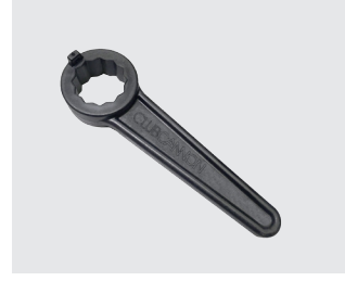
Co2 Attachment Tool Used to tighten the CGA-320 fitting to your co2 tank.