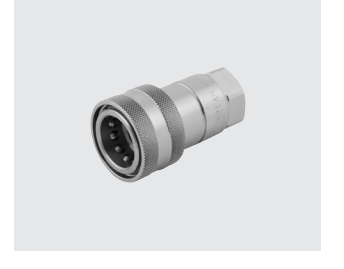
Output Terminator Used at the end of your Co2 line, terminating the Co2 output.