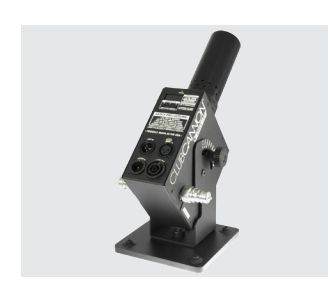
Co2 Jet The most important piece to the puzzle.

The following components are included with every Club Cannon® Co2 Jet. Double check your package to make sure you have every piece necessary for proper operation of your new co2 Jet.