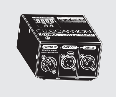
POWER PACK The most important piece to the puzzle.

The following components are included with every Club Cannon® Power Pack.