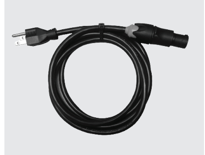
TRUE1 POWER CORD Edison to PowerCON True1 cord, rated for 13A.