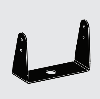
YOKE BRACKET Used to attach a truss clamp or other mounting hardware.